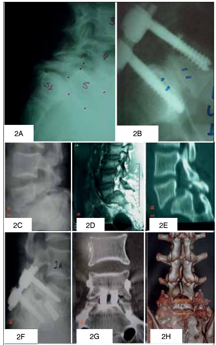
Figure 2. Dysplastic type spondylolisthesis of L5-S1(2A). Fixation of spondylolisthesis with a bone graft in the 1st post-operative year (2B). Pre-operative X-ray with Gill spondylolisthesis (2C). Magnetic resonance.(2D). Computed tomography (2E). Patient in the 2nd post-operative year showing pedicular fixation (2F). Tomography showing consolidated arthrodesis (2G e 2H).

It is known that today, bone fusion in situ is the surgical procedure used in children. 22,23 However, it has the following problems: