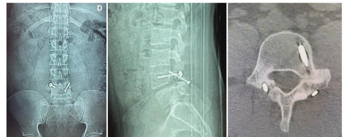
Figure 3. Postoperative X-rays and axial CT scan of the lumbar spine with three months of follow-up.