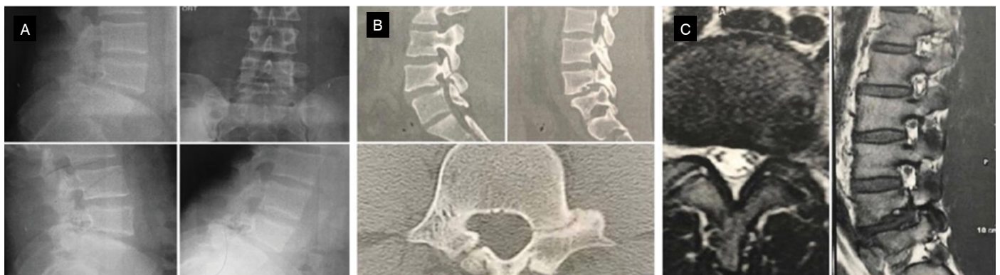
Figure 1. X-rays of the lumbar spine in anteroposterior (AP) view, profile, and dynamic in flexion and extension (A); sagittal and axial cuts of the preoperative lumbar CT (B); T2-weighted axial cut and T1-weighted sagittal cut of the preoperative MRI (C).