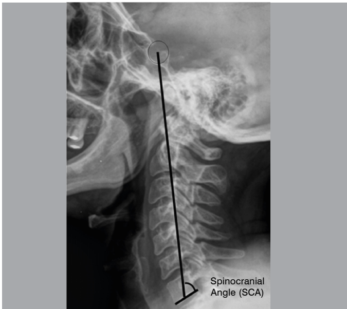
Figure 3. Measurement of the Spinocranial Angle (SCA).